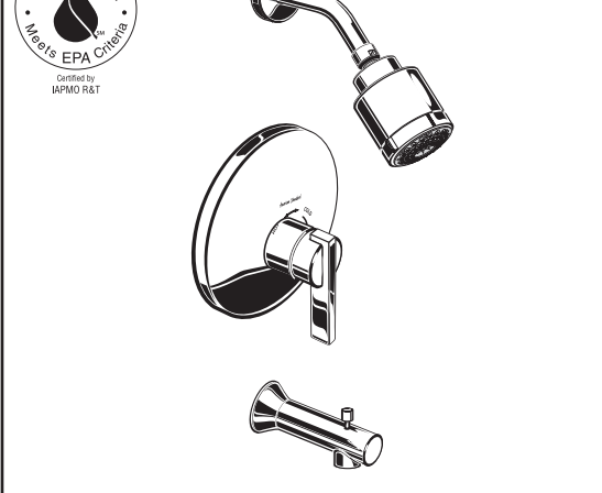
T430.508 Bath/Shower Trim Shown

Bath/shower fitting shall feature water saving 3-function showerhead with Max. 2.0gpm/7.6L/min. flow rate. Shall feature a cast brass body. Shall feature ceramic disc valve cartridge which is capable of back-to-back installation. Fitting shall be equipped with pressure balancing cartridge engineered to eliminate cross flow and avoid failure due to mineral deposits. Shall also feature hot limit safety stop. Fitting shall be: Rough Valve Body - American Standard Model # R11____, Trim Kit - American Standard Model # T430.50_.____.