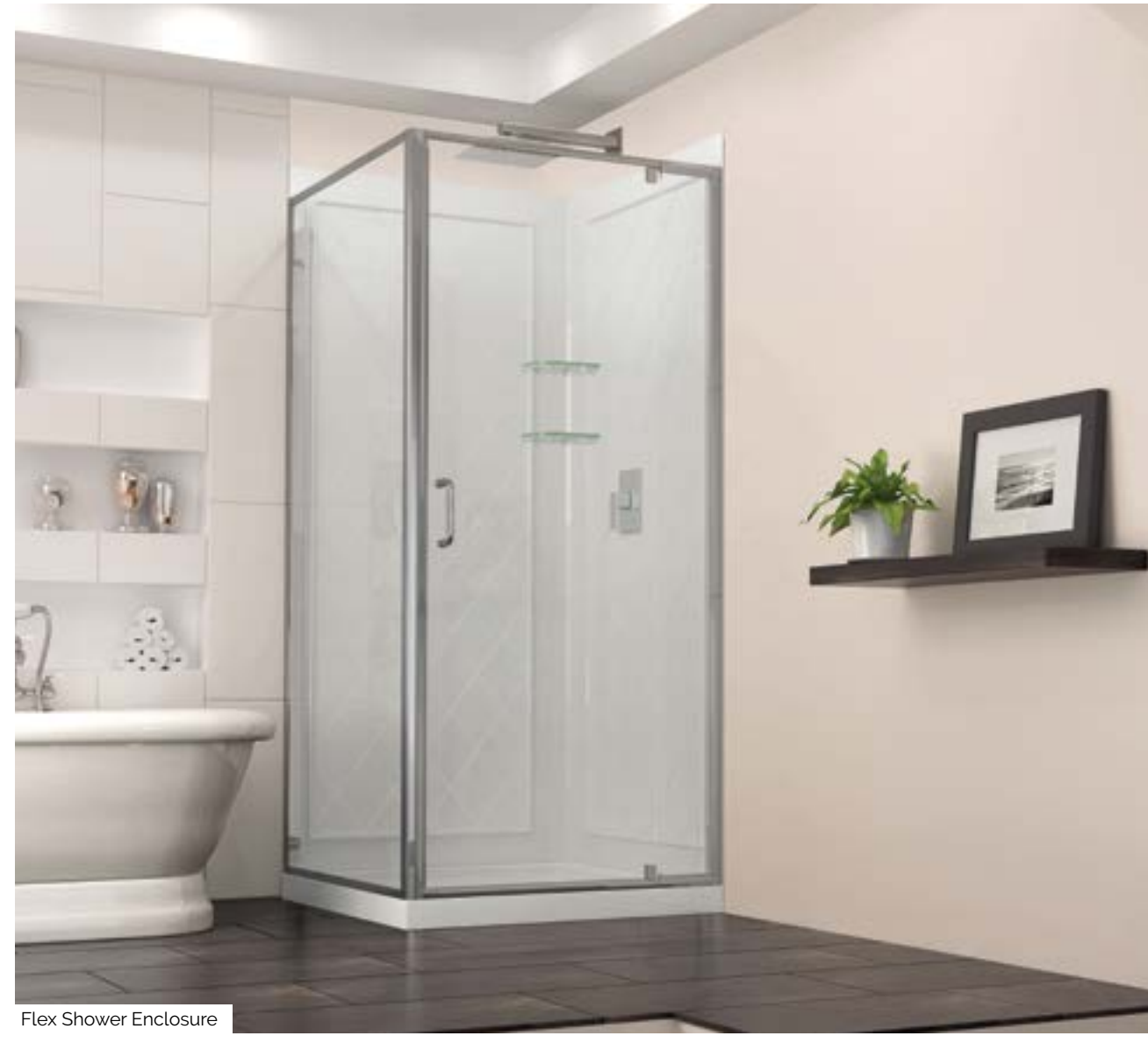
* Shown with Optional Base and Backwalls