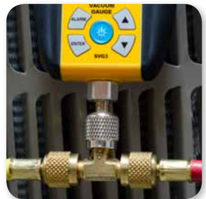
Traditional: In-line Between System and Vacuum Pump