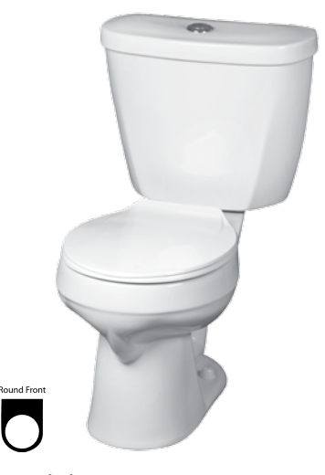
Model 380-3386 Toilet seat not included