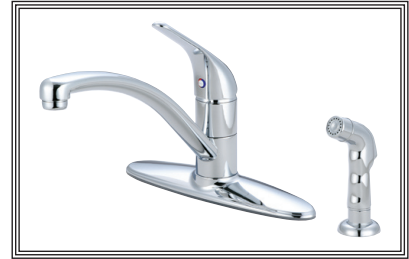
#2LG161H SHOWN * ADA