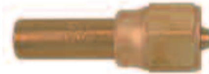
Type UM Length 2-1/2"