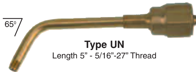
Type UN Length 5" - 5/16"-27" Thread