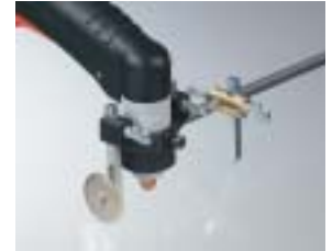
Cutting Guide Kit Cat. No. 7-7501

CutSkill® C-20C Air Plasma Cutting System with Built-in Air Compressor