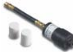
Single Stage Air Filter Cat. No. 7-7507