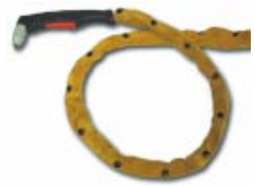
Leather Leads Cover Cat. No. 9-1260