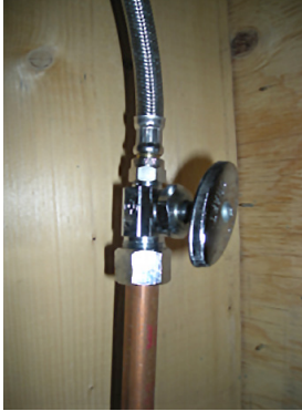
Typical Dishwasher Water Supply Line & Shut-off Valve

Shut off the hot-water supply to the dishwasher. Some homes have a separate shut-off valve just for the dishwasher line. Some will have a single shut-off valve which shuts off all the hot water under the sink—to the sink faucet and the dishwasher. Now use an adjustable wrench to disconnect the dishwasher hot water supply line that connects to the faucet supply valve.