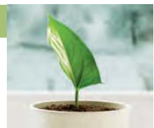
Low carbon, renewable energy domestic hot water systems