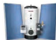
Solar hot water