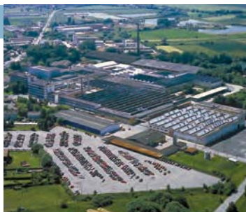
Stiebel Eltron's plant in Holzminden, Germany.

Stiebel Eltron has been a world leader in the development of advanced water heating technology for more than 90 years. Our pursuit of engineering excellence and high-quality manufacturing results in products fulfilling the highest expectations of performance and reliability. They are... Simply the Best.