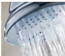
Efficient tankless electric water heaters