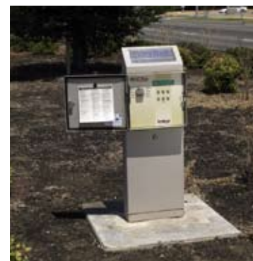
IBOC-12PLUS/SPC-2 ON P-2B