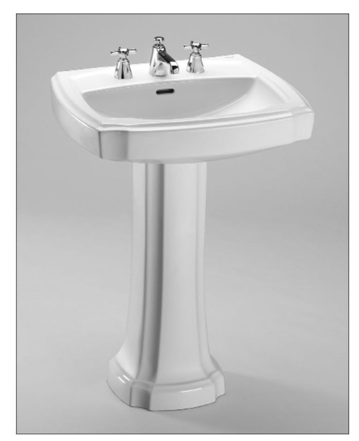
Faucet sold separately