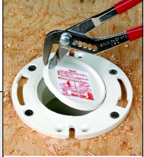
Remove knockout with pliers—it always comes out in one piece!

Knockout stays in one piece while it drops 1/8"—won't shatter into drain line.