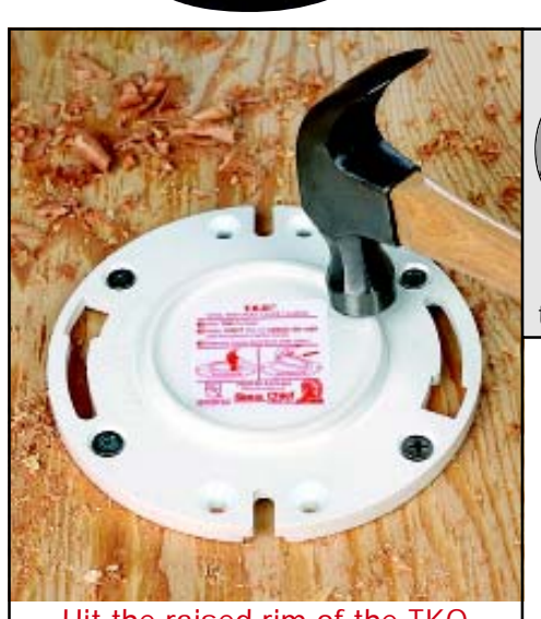
Hit the raised rim of the TKO until the knockout cracks loose.