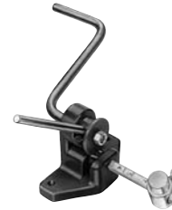
Disc Trimmer 49-80-1000