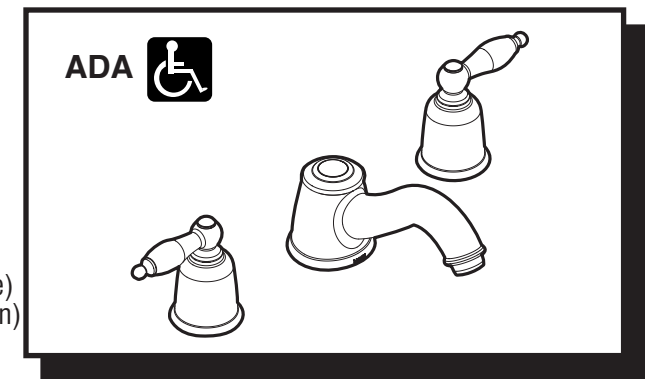
CASTLEBY™ Two Handle Garden Tub Faucet

Models: T4933, T4933CP, T4933CPC, T4933P, T4933ST, T4933STST