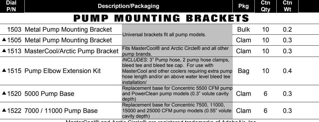
MasterCool® and Arctic Circle® are registered trademarks of AdobeAir, Inc.