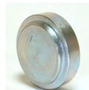
BLOWER SHAFT PLUG