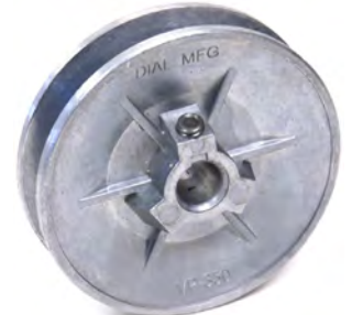
VARIABLE (ADJUSTABLE) PULLEY