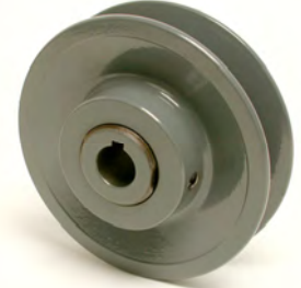
IRON VARIABLE (ADJUSTABLE) PULLEY