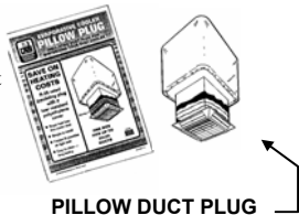
PILLOW DUCT PLUG