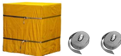
E-Z STRAP™ COVER TIE DOWNS