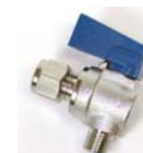
ANGLE BALL VALVE (stainless steel)