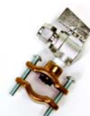
1/4 SS BALL VLV & BRASS SADDLE