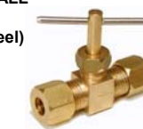
COMPRESSION NEEDLE VALVE