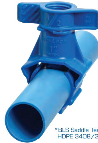
*BLS Saddle Tees for use with all brands HDPE 3408/3608 Pipe