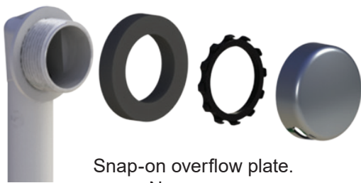
Snap-on overflow plate. No screws