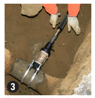
Turn independent feed until the pilot drill touches the pipe.