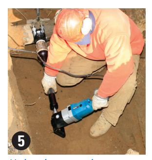
Make the tap, then reverse the process.