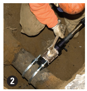
Open corp stop valve.