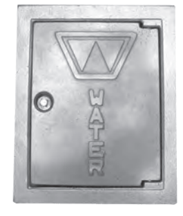
Model & Inlet B24P-1/2 1/2" FPT B24P-3/4 3/4" FPT