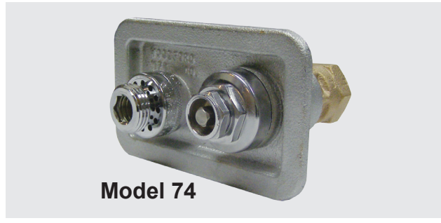
Exterior Finish: Standard - Chrome (CH) Optional - Brass (BR) Polished Brass (PB)