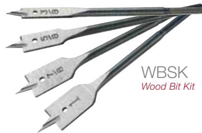
WBSK Wood Bit Kit

Unique designed ground points and cutting edges drill faster, cleaner holes, using less power than standard spade type bits. Cut straight or angled holes in soft and hard woods, plus formica, plaster, chipboard, foam core material, many non-metallic building sidings and foam insulation. Made of one-piece special heat treated tool grade steel. Six "flat" 1/4" shank fits securely in conventional chucks. Easy to spot "size marking" is stamped on head. Bits also feature "head hole" for convenient storage and wire pulling. Resharpenable with saw file or grinder. Available individually or in sets.