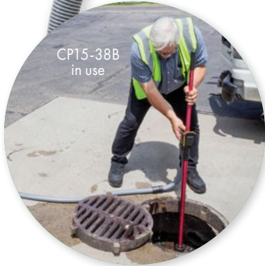
CP15-38B in use

Rugged construction of pump, along with screen/filter system and battery adapter plates set this pump apart from any competitive methods.