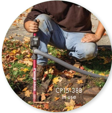
CP15-38B in use