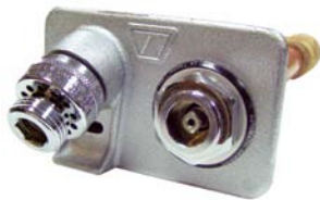
Model 65 with Single Check Vacuum Breaker