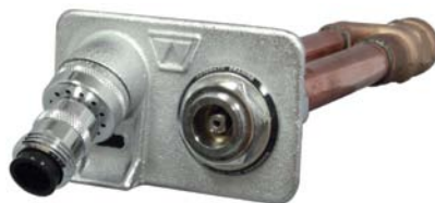
Model 67 with Double Check Backflow Preventer