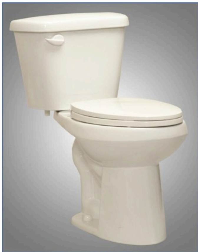
With Western the water savings are significant and maintenance is minimal.

Our customers tell us it's "The Best Flushing Toilet in America!"