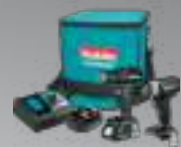
CX201RB // PG. 13