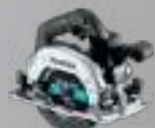
XSH05ZB // PG. 23