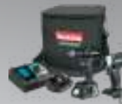
CX200RB // PG. 13