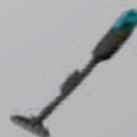
XLC01ZB // PG. 36