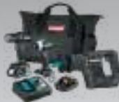
CX300RB // PG. 12