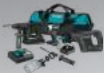
CX303TRB // PG. 12

Makita ® created a new class in cordless with 18V LXT ® Sub-Compact Brushless tools. Makita ® Sub-Compact tools are the most compact and lightest weight in the 18V category, so users get 12V handling with 18V compatibility. Sub-Compact tools use the same 18V batteries and chargers that work with over 200 solutions in the LXT ® system.