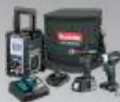
CX301RB // PG. 12