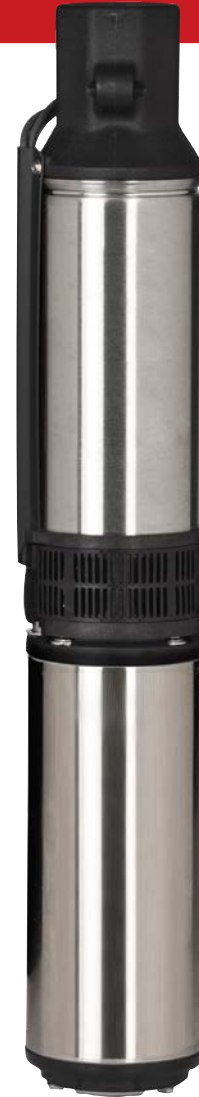
4" Submersible Well Pumps