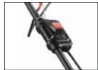
Ergonomic safety push button