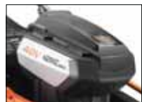
Our one size fits all battery provides extreme efficiency