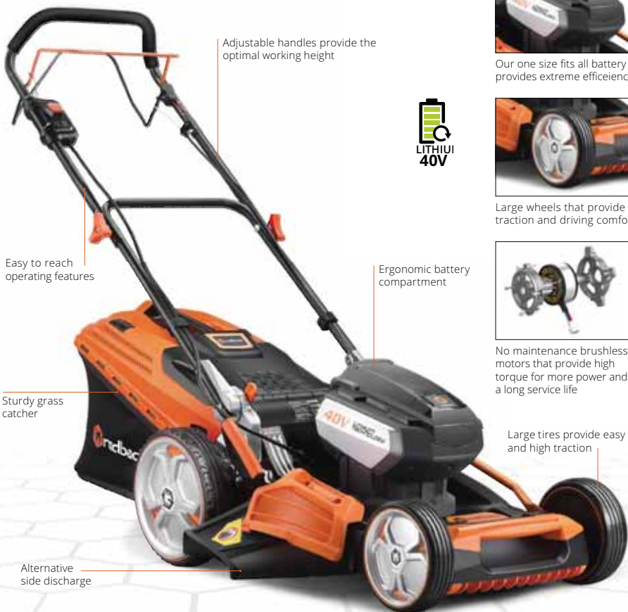
Adjustable handles provide the optimal working height