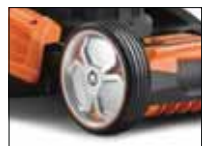
Large wheels that provide terrific traction and driving comfort