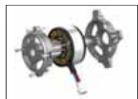
No maintenance brushless motors that provide high torque for more power and a long service life