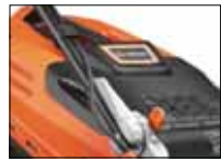
Extreme stability due to the aluminium height adjustment

Redback mowers are easy to handle, friendly for the environment and very quiet.