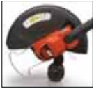
Bump feed spool

The E312D trimmer is an indispensable tool for all garden owners, combining ergonomics with ease of use.