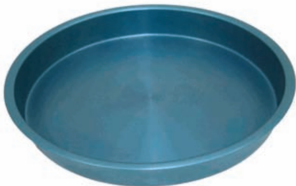
1020 SERVING TRAY 14" Diameter x 2.25" Deep Anodized Aluminum