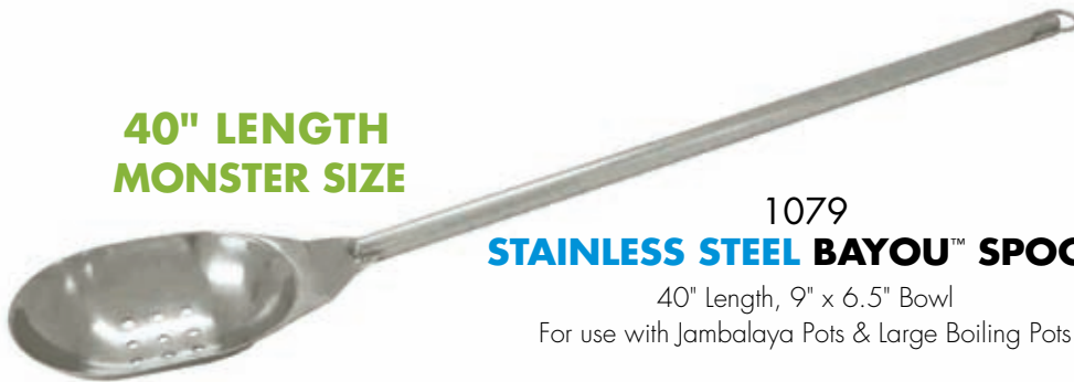
1079 STAINLESS STEEL BAYOU™ SPOON 40" Length, 9" x 6.5" Bowl For use with Jambalaya Pots & Large Boiling Pots