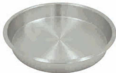
500-588 SERVING TRAY 14" Diameter x 2.25" Deep Aluminum