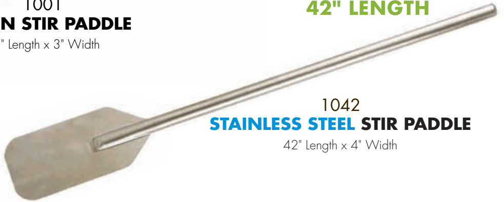
1042 STAINLESS STEEL STIR PADDLE 42" Length x 4" Width