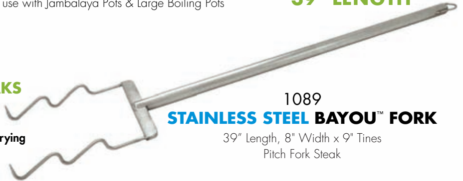
1089 STAINLESS STEEL BAYOU™ FORK 39" Length, 8" Width x 9" Tines Pitch Fork Steak

HOLD 6 BEEF STEAKS AT ONE TIME Skewer Steaks, Pork Chops, & Chicken Breasts for Deep Frying