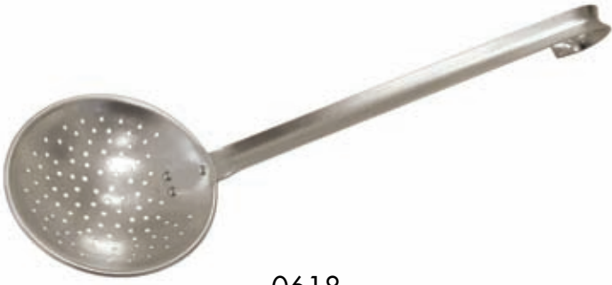
0618 PERFORATED ALUMINUM SKIMMER 24" Length x 7.5" Bowl