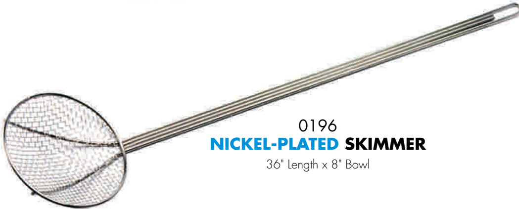
0196 NICKEL-PLATED SKIMMER 36" Length x 8" Bowl