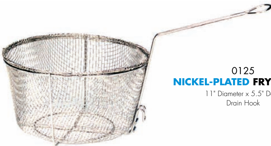
0125 NICKEL-PLATED FRY BASKET 11" Diameter x 5.5" Deep Drain Hook