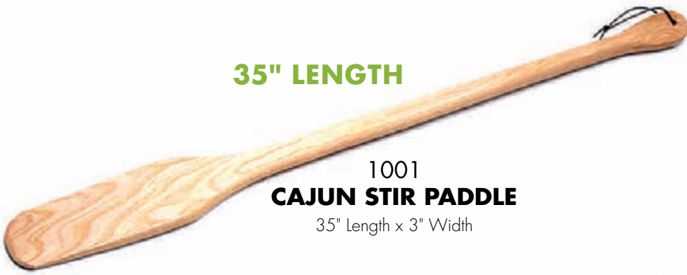
1001 CAJUN STIR PADDLE 35" Length x 3" Width