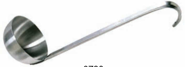
0723 LARGE ALUMINUM LADLE 20" Length x 6" Cup