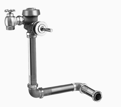
Variation Not Shown: 1" Straight Control Stop