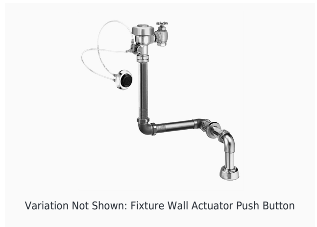
Variation Not Shown: Fixture Wall Actuator Push Button