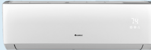
3VIR09HP230V1AH & BH 1