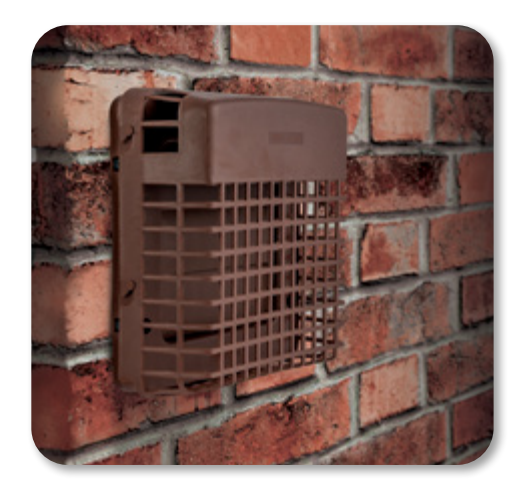
Also available in brown