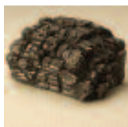
Fiber ceramic ember remote receiver cover-RRCE