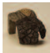
Fiber ceramic pilot safety or manual valve cover-VWFMC