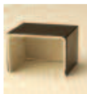
Metal remote receiver cover-RRCM