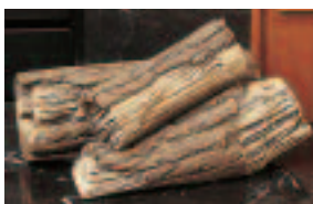
Fiber ceramic log remote receiver cover-RRCL