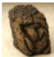
Fiber ceramic millivolt valve cover-VWFMVC